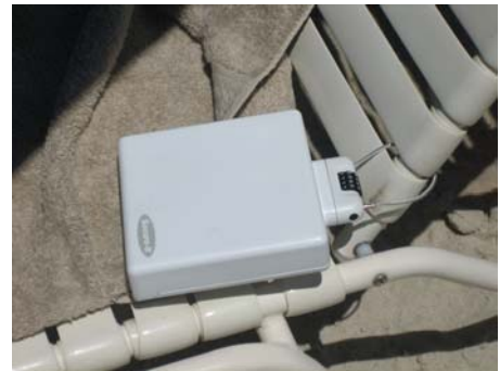
Locked to beach chair.